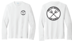
LONG SLEEVE WHITE TEE $28 Limited sizing: M, L, XL, XXL