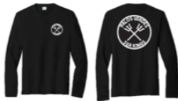
LONG SLEEVE BLACK TEE $28 Limited sizing: M, L, XL