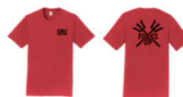
RED TEE $25 Adult sizes S-XXL