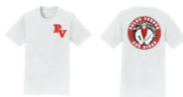
WHITE TEE $25 Adult sizes S-XXL